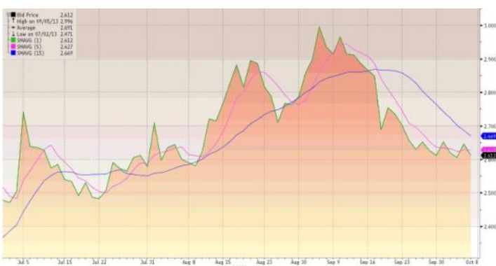
Chart 1: 10-year Bond Yield for 3Q13

We continue to believe that the balance of the year will see more volatility as the markets adjust to the possibility of uneven GDP growth, the potential for FOMC tapering in the first quarter of 2014, the lingering effects of the government shutdown and the risk of a default.