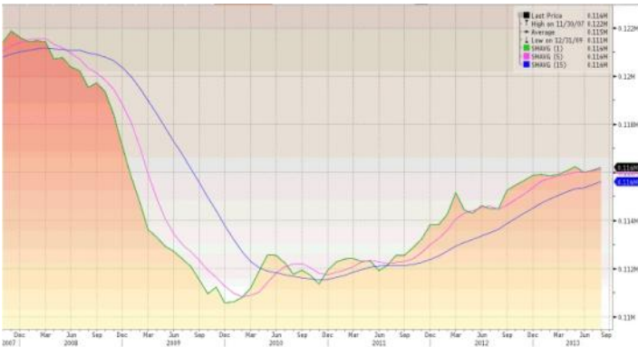
Chart 6: U.S. Full-time Employment