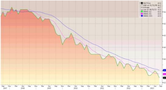
Chart 5: U.S. Labor Participation Rate