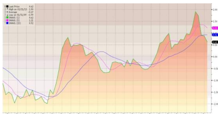
Chart 2: Case-Shiller Home Price Index

revised down across the board, resulting in a short-term decline in home prices that we hope is temporary (Chart 3). However, demand continues to outstrip supply at the low end for first-time home buyers, and the demand for housing and related goods continues to be a positive for durable goods, such as automobiles and appliances.